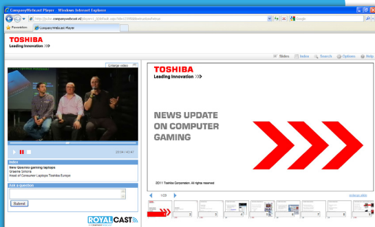
Toshiba informs the press about product launches.