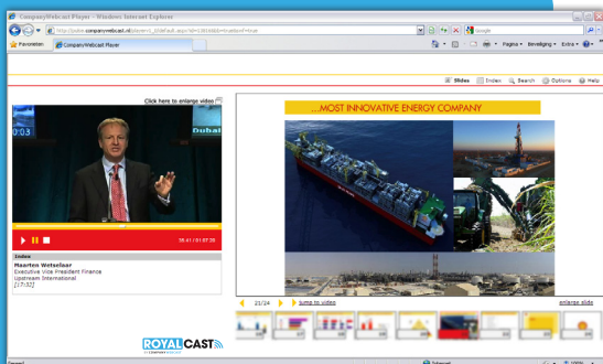
Shell informs her global management team.

INFORM YOUR STAFF USING THIS EFFICIENT AND EFFECTIVE CHANNEL