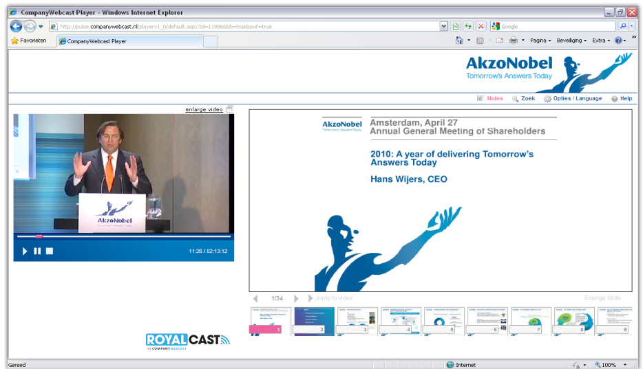
The speech of the CEO of AKZONOBEL during the shareholders meeting stays On Demand available.