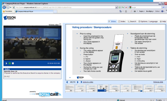
AEGON lets shareholders participate interactively.