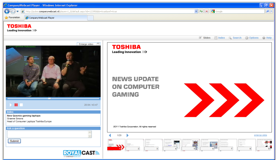
Toshiba uses Webcasting for her global product launches.