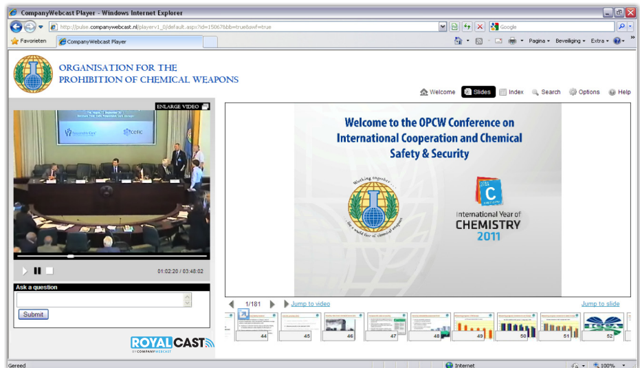
The UN organization OPCW makes her conferences worldwide available via Webcasting.

We are also the right company if you would like to Webcast a meeting abroad. We work throughout the world and regularly take care of Webcasts in such countries as England, Belgium, Germany and the United States.