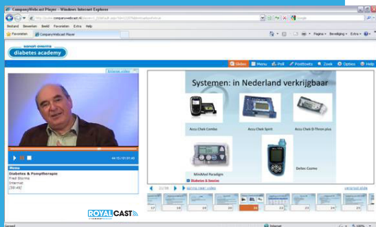
Sanofi Aventis provides Webcasting seminars.