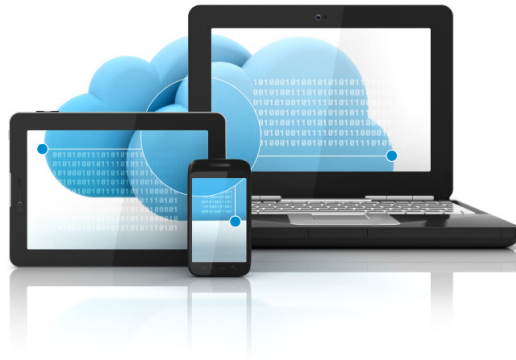
All meetings can be followed on computers, laptops and mobile devices such as an iPad and iPhones.